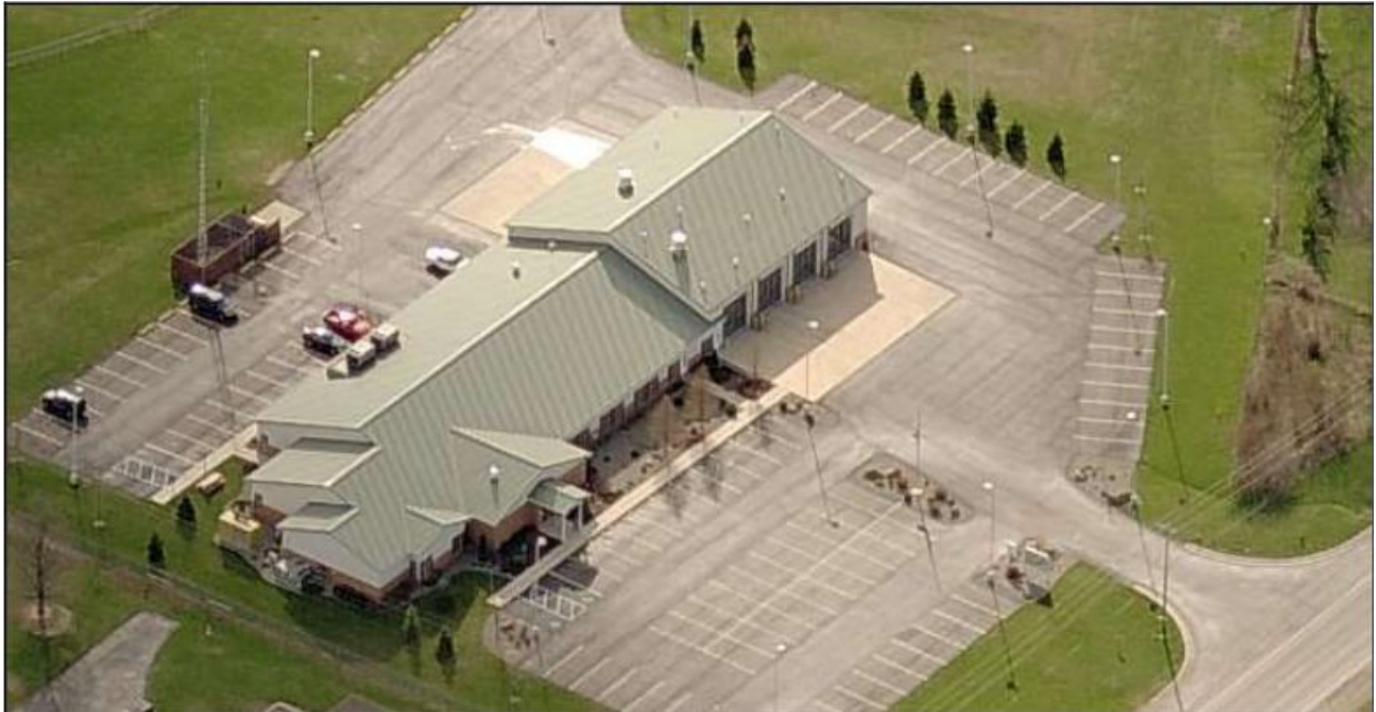
Napoleon Township Office