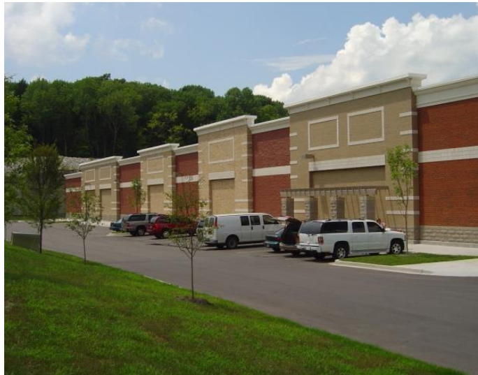
Figure 2: This figure shows two methods of using architectural features to create wall surface relief on wall elevations that are not the primary elevation.