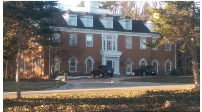
Figure 1: The above images represent some examples of architectural styles found in the Western Reserve areas of Ohio.