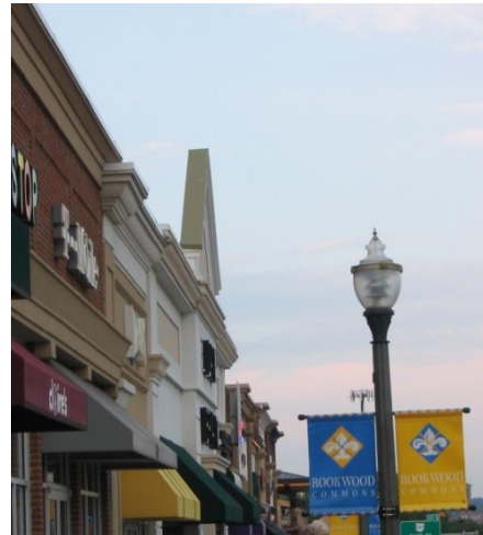
Figure 5: Parapet walls with cornice treatments are used to disguise flat roofs. The image on the right illustrates a tall, thin parapet wall that is prohibited.