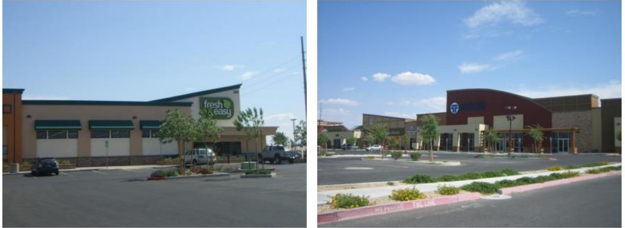
Figure 6: These images show two different buildings with asymmetrical rooflines.