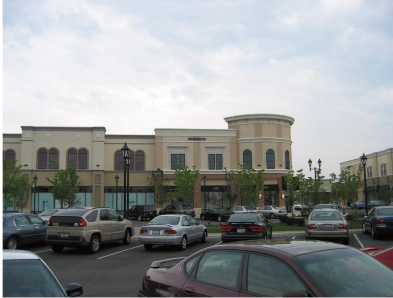
Figure 4: Roofline changes shall be aligned with corresponding wall offsets and/or material or color changes.