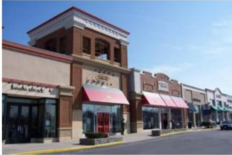
Figure 3: Illustration of façade treatments such as pilasters, projections, and material changes to provide a visual façade offset.