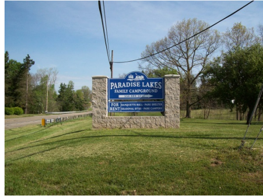
Low Profile Ground Mounted