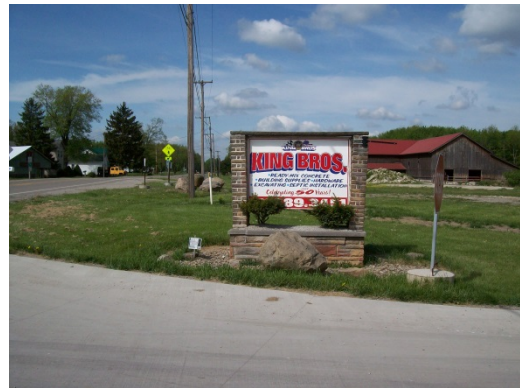
Low Profile Ground Mounted