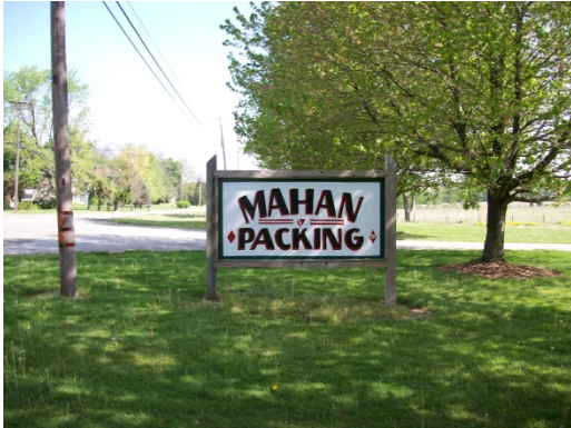
Low Profile Ground Mounted